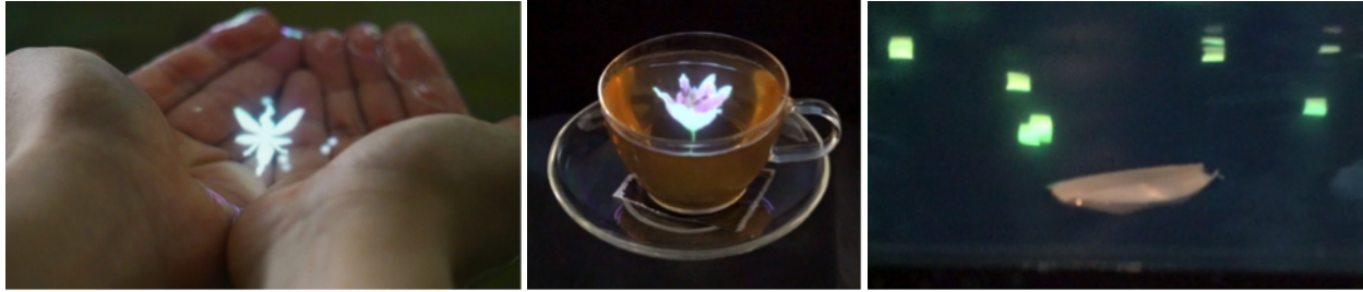
Figure 1: Left: FairLift. Center: Augmented RealTea. Right: Sky Lanterns

The University of Electro-Communications JST PREST koizumi.naoya@uec.ac.jp