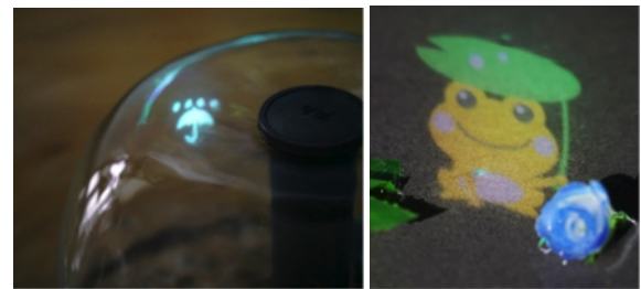
Figure 4: Left: mid-air image on water surface of fountain. Right: mid-air image on road wet from rain.

The reality that FairLift can augment is not only the static water surface space. For example, the system can present a mid-air image on the water surface of a fountain and a road wet from rain (Figure 4). Furthermore, when physical limitations regarding MMAPs size are solved, we expect that the proposed system will be suitable for different bodies of water such as ponds, riversides, and seas.